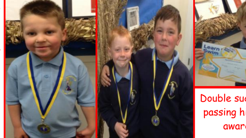
Learn to Swim

The boys all play for Wallsend Under 8s.