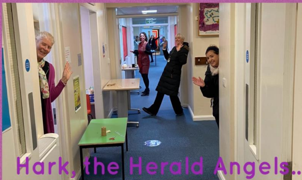
Hark, the Herald Angels...

for inclusion on our blog- and upload to our Facebook page! Thanks!